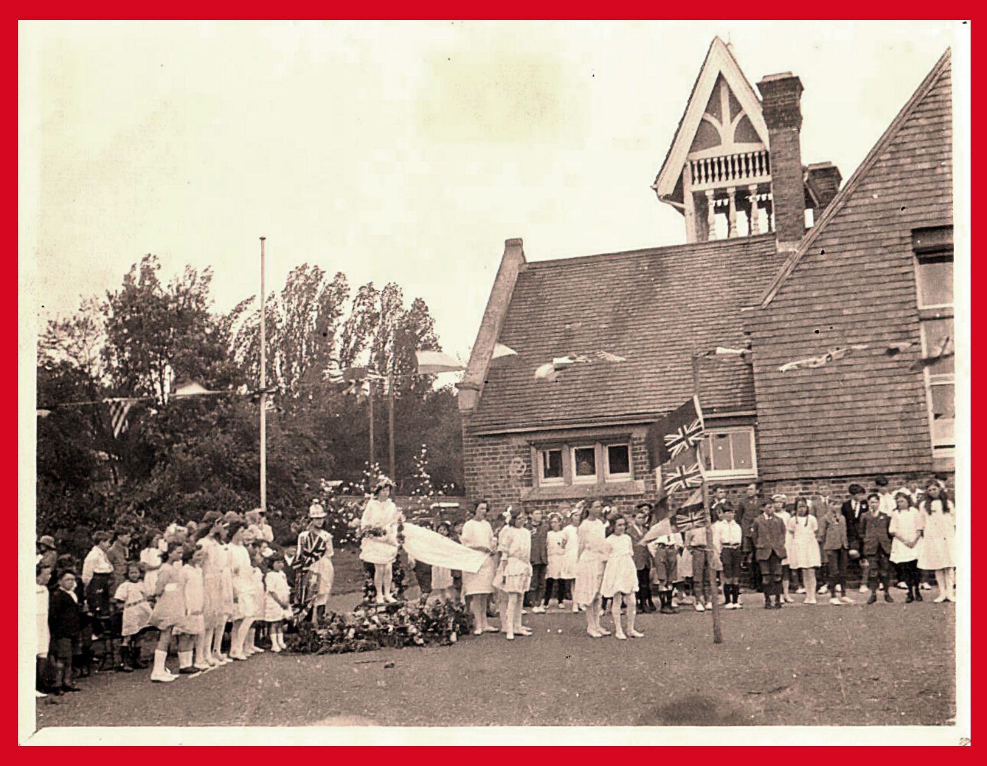
Egham Museum 2788 Egham - Empire Day at Egham School (unknown date)