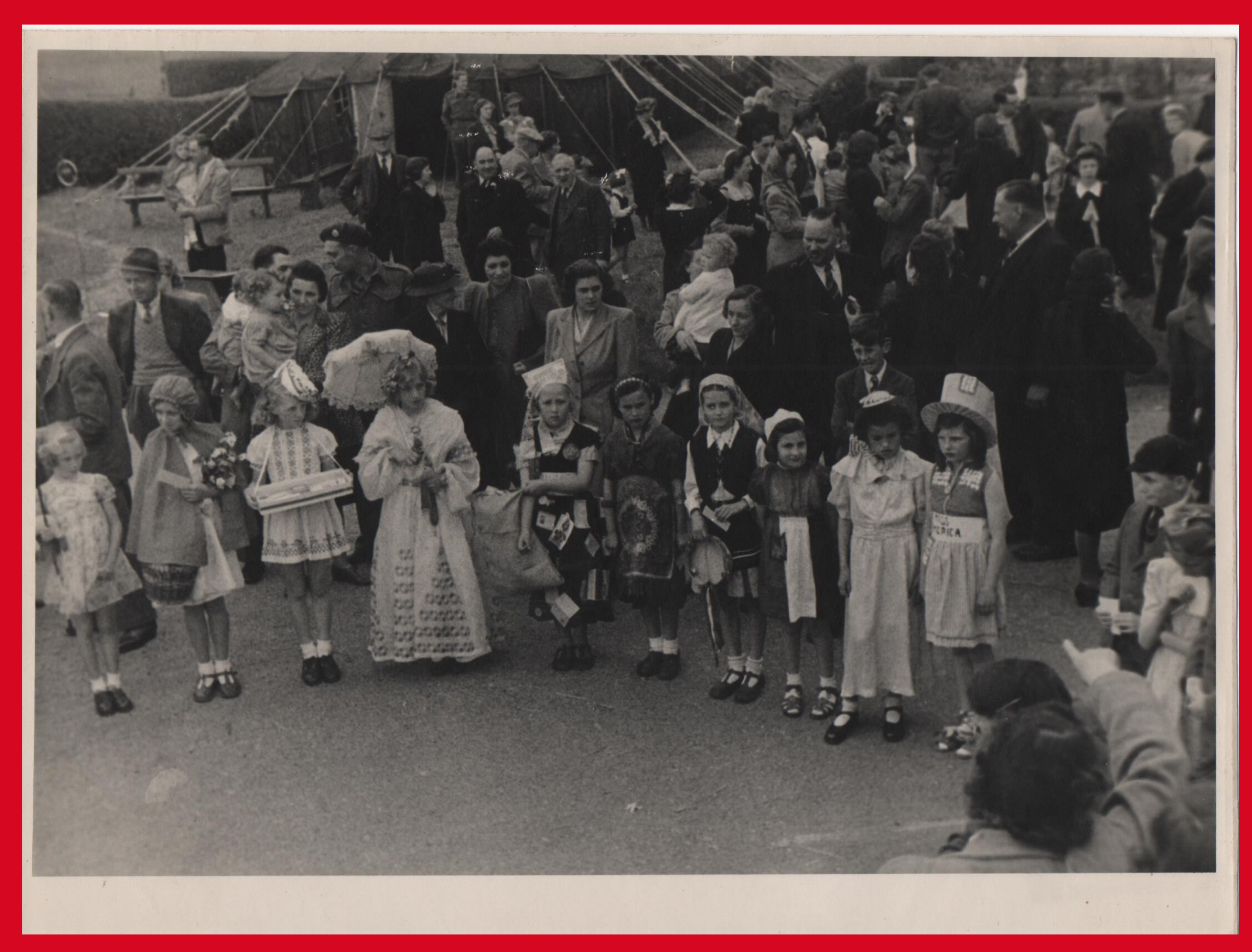
Egham Museum 3456 Trumps Green Victory Party 1945 This marked the start of the Community Association and the Community Centre opened in 1950

We have included some additional photos of street parties and other celebrations in the area, they can be used alongside the other activities in this pack.