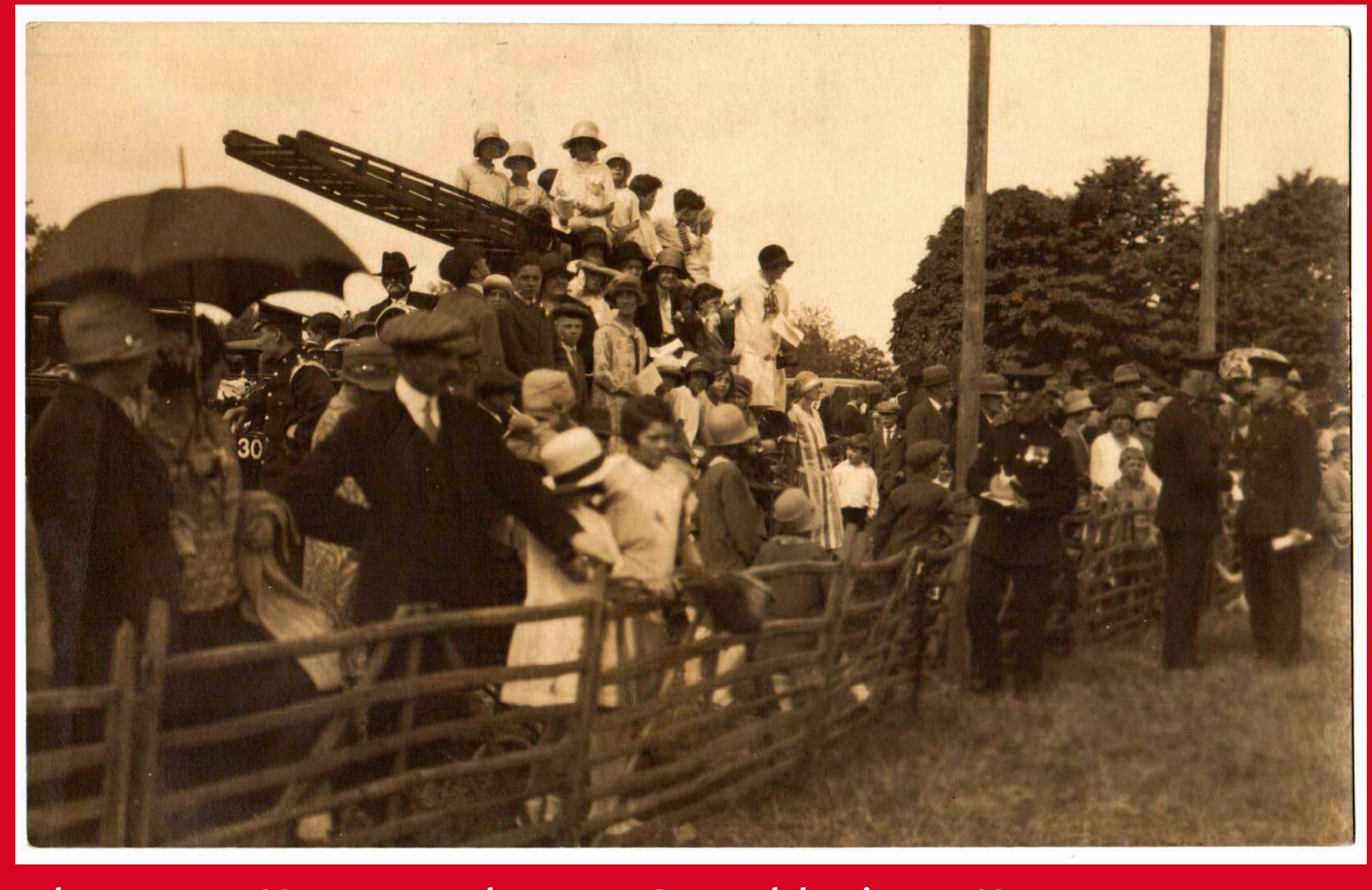
Egham Museum 3851 Runnymede - Magna Carta celebrations c.1925