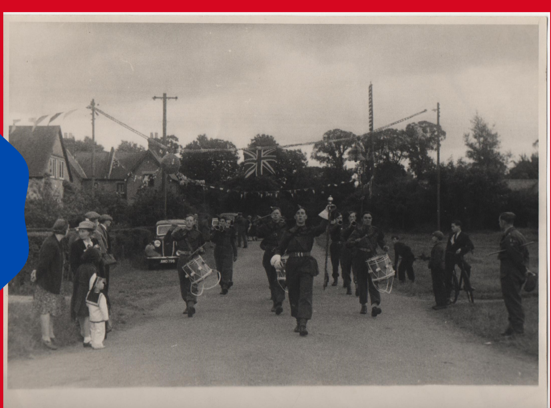
Egham Museum 3456 Trumps Green Victory Party 1945

Music has always been a huge part of community celebrations. Lots of songs, including the National Anthem were sung by the crowds at VE Day celebrations in 1945 and at Coronation and Jubilee celebrations since.