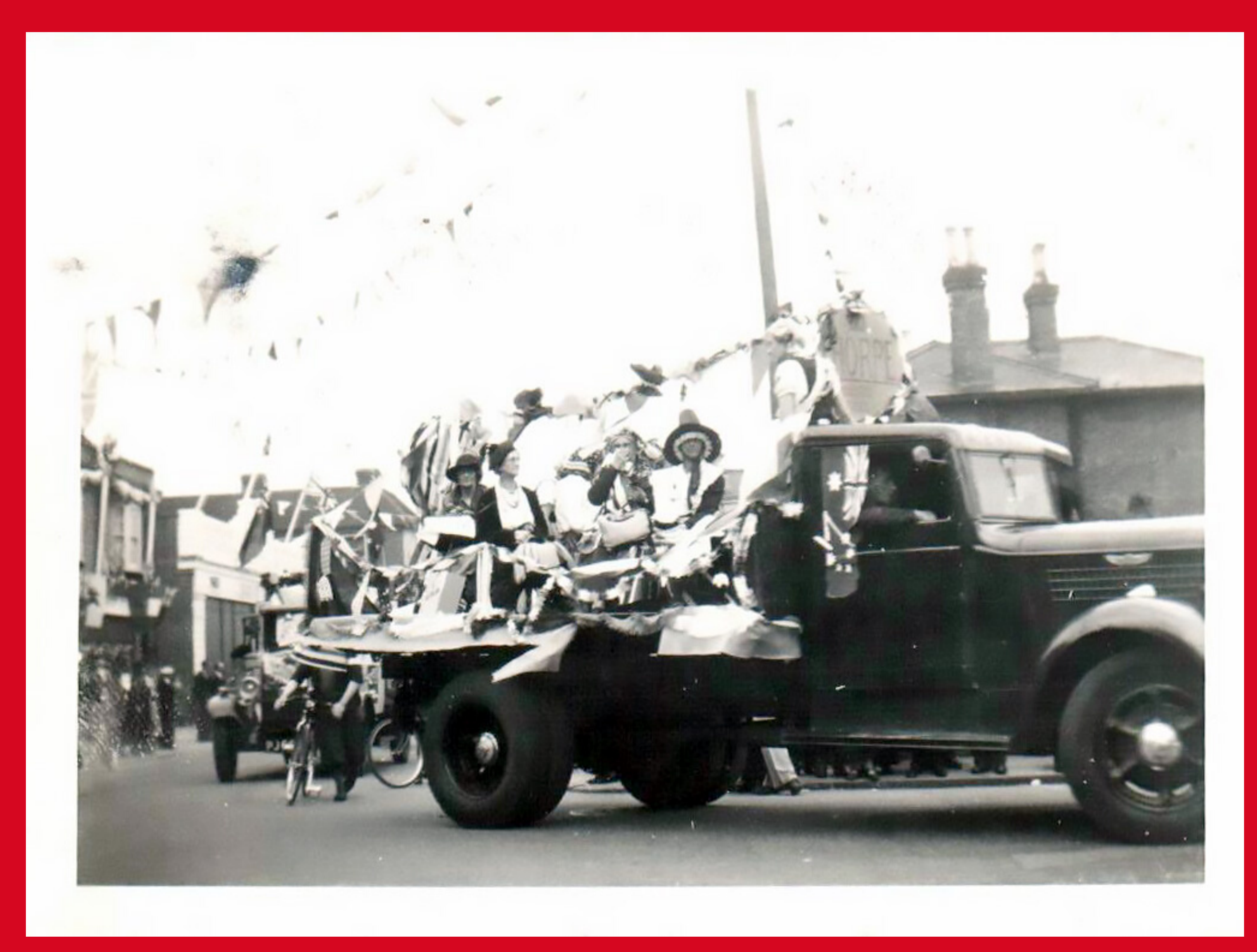
Egham Museum 3340 Coronation Procession 1937 in High Street