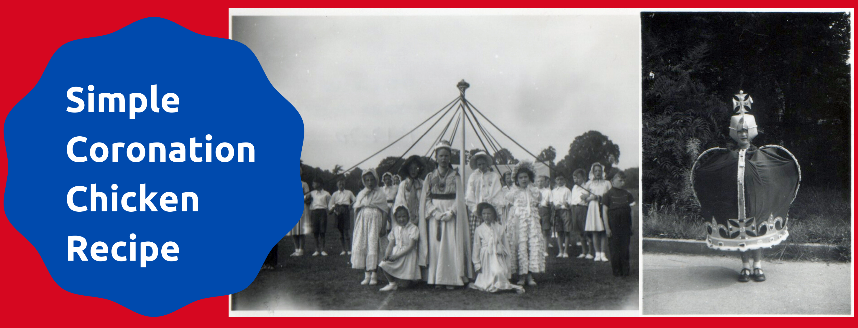
Egham Museum P1270 and P1271 Christchurch School, Virginia Water, Coronation Celebrations 1953

Coronation Chicken was a dish created for Queen Elizabeth's coronation in 1953 and was based on an earlier dish used for the Silver Jubilee of King George V in 1935. This simple recipe is a great starting point but you can add sultanas and other dried fruit to taste.