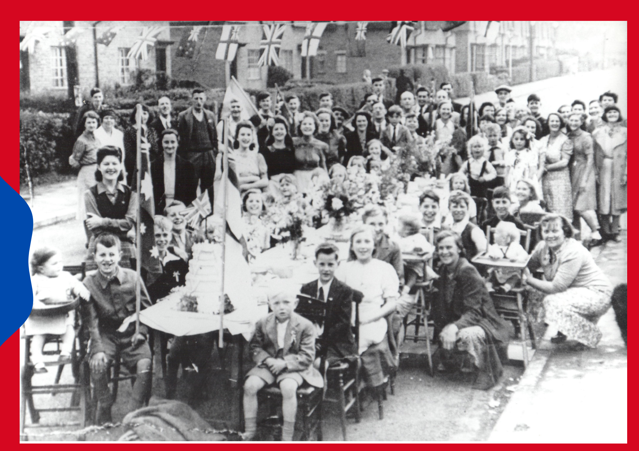
Egham Museum P3918 Street Party in Mullens Road, Pooley Green 1945

These questions are a great starting point for a conversation about street celebrations, they can be adapted for conversations between friends/family members or in a school/care home setting. You might want to use the images at the back of this pack as a visual prompt.